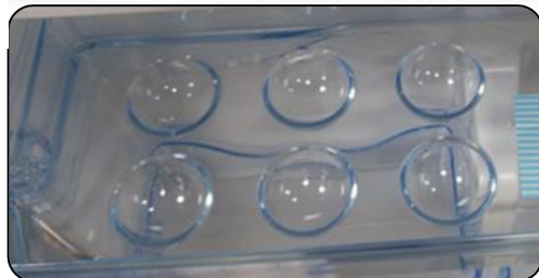
In-built Egg Tray