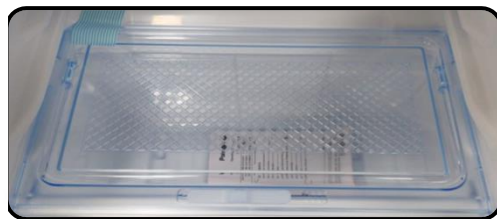
Honey Comb Veg Cover