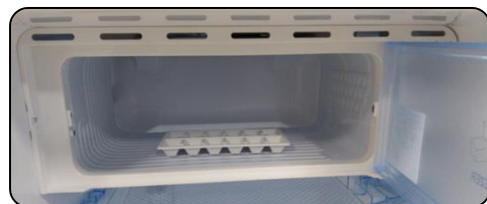
Transparent Freezer Door & Ice Tray